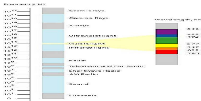
Figure 6. The Radio Wave and Light Wave Frequency Spectrum

In the event that LED moving information at a slow rate, so a large number of LEDs with one micron measure are introduced in the bulbs. The decrease of size of LEDs does not deficiency, its capacity to move information or power on the inverse it expands the productivity of one light to transmit the information at an abruptly higher rate. At the point when Wi-Fi is exceptionally well known for inescapable 100+ Mbps benefit, multi-Gigabit short-extend optical remote interconnects give a substitute to the proposed [6] Gigabit RF arrangement. For correspondence point light wave conveys information in a quick way, yet in radio wave the information exchange rate is drowsy. Along these lines that cause we are searching for light wave communication. It is appeared by the Figure 6. Nonetheless, the downside that light does not infiltrate through the wall and no communication in murkiness.